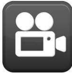
Vin Butera Video